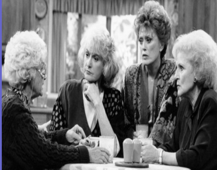
Rue McClanahan, second from right, with The Golden Girls ' co-stars Estelle Getty (left) Bea Arthur and Betty White

McClanahan, born Edi-Rue McClanahan in Healdton, Oklahoma, February 12, 1934, started off as an actress mostly in off-Broadway and regional plays in the 1960's. Though she had done a few television commercials, it wasn't until producer Norman Lear cast her as the best friend to Beatrice Arthur's on-screen character in Maude (CBS) that McClanahan got away from the stage. After Maude ended in 1978, her next major television role was the short lived Mamma's Family (NBC) in 1983 where she played the role of