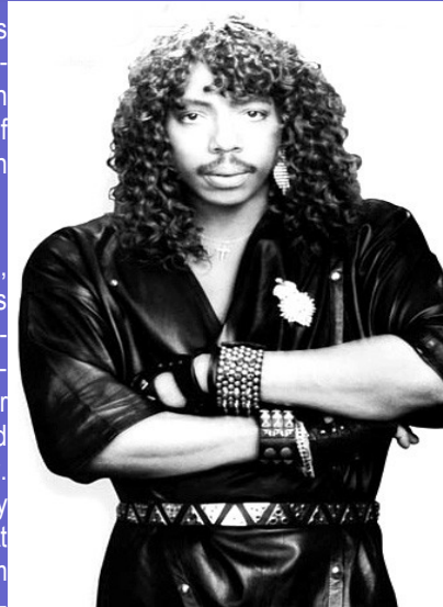
Rick James February 1, 1948 — August 6, 2004

After spending a year in a military prison, James moved to Detroit and found work as a staff songwriter for Motown. He also continued to be a journeyman bass player, performing in or starting