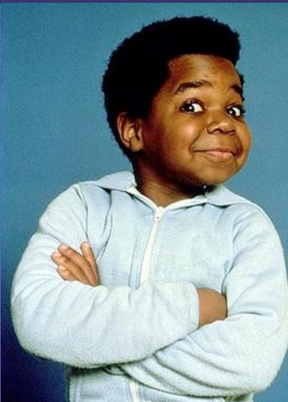
Gary Wayne Coleman, February 8, 1968 — May 28, 2010